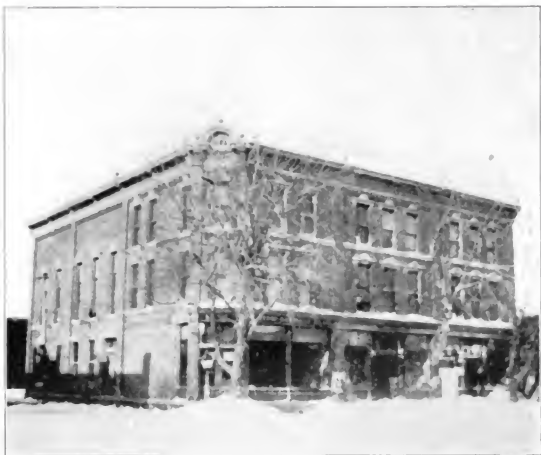
FIRST NATIONAL BANK BUILDING, GARNER

Built in 1892. Destroyed by fire January 1, 1902.